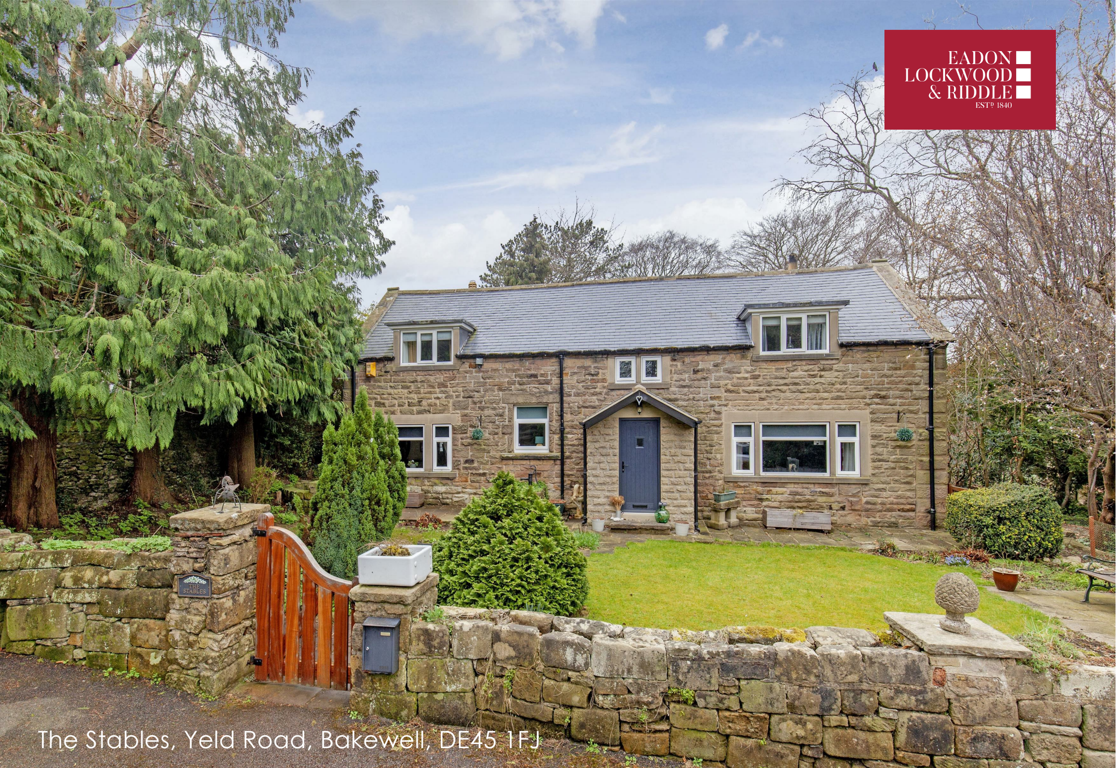
The Stables, Yeld Road, Bakewell, DE45 1FJ